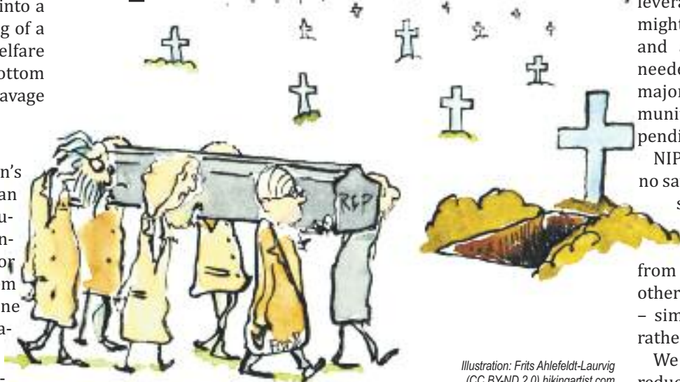
Illustration: Frits Ahlefeldt-Laurvig (CC BY-ND 2.0) hikingartist.com