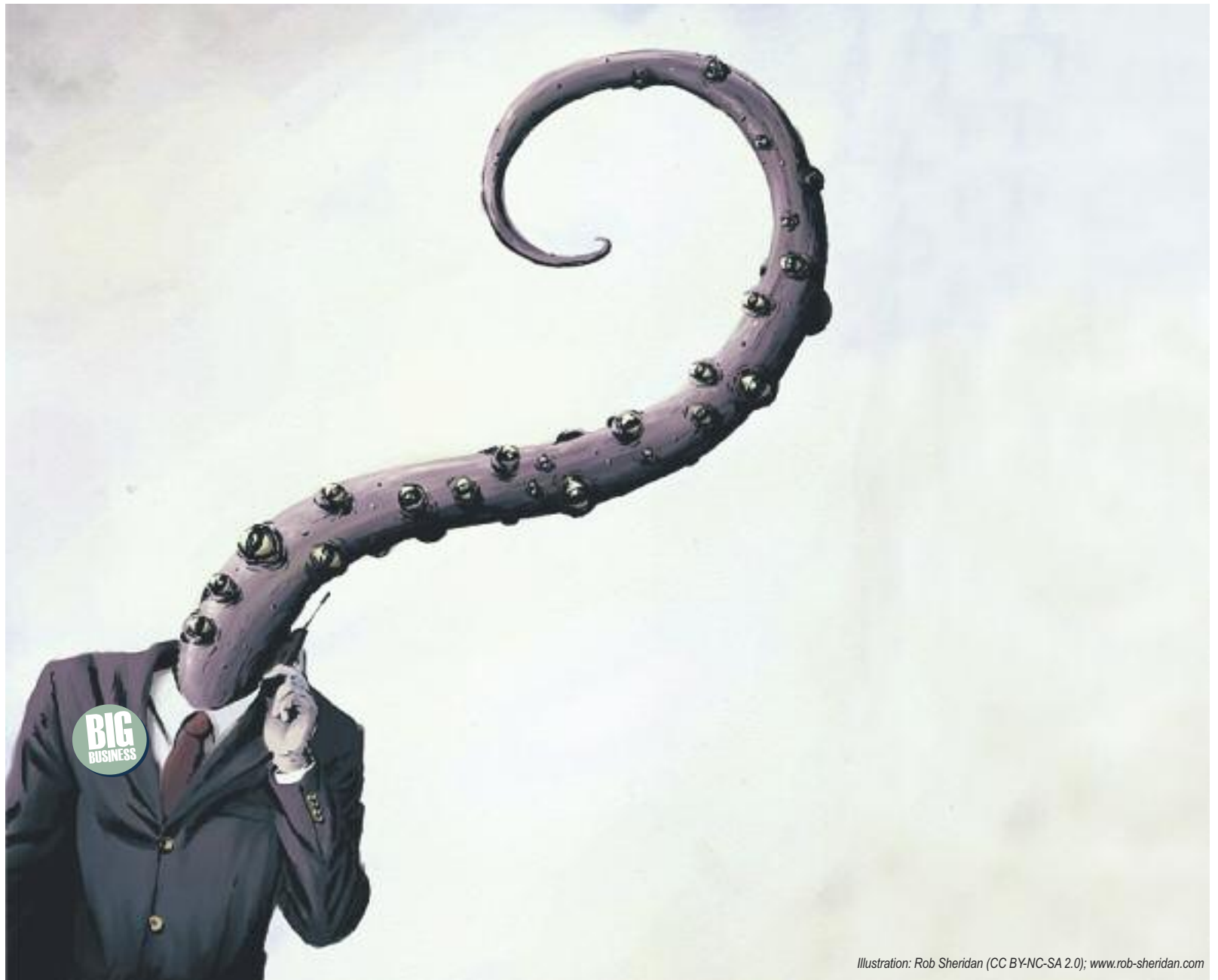
Illustration: Rob Sheridan (CC BY-NC-SA 2.0); www.rob-sheridan.com

It is even more unclear that we would attract significantly more foreign companies into Northern Ireland with low Corporation Tax. Why? Companies don't decide